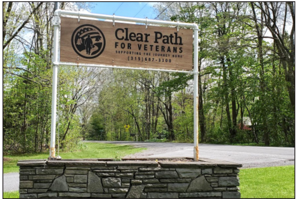
The entrance to the Clear Path facility.