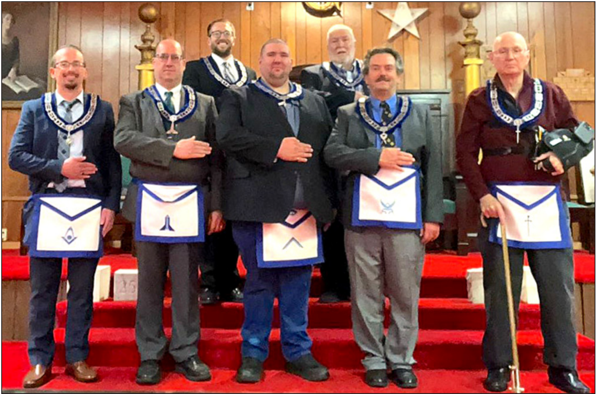
Fort Brewerton Lodge elected and installed its officers. Here is the line.