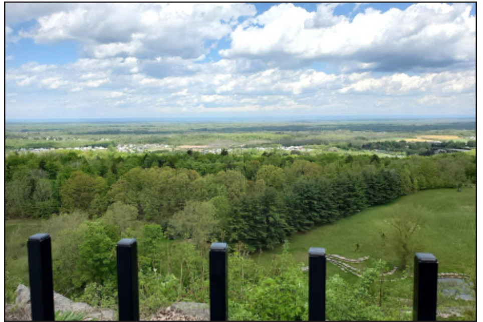
The view from the hills of Clear Path.