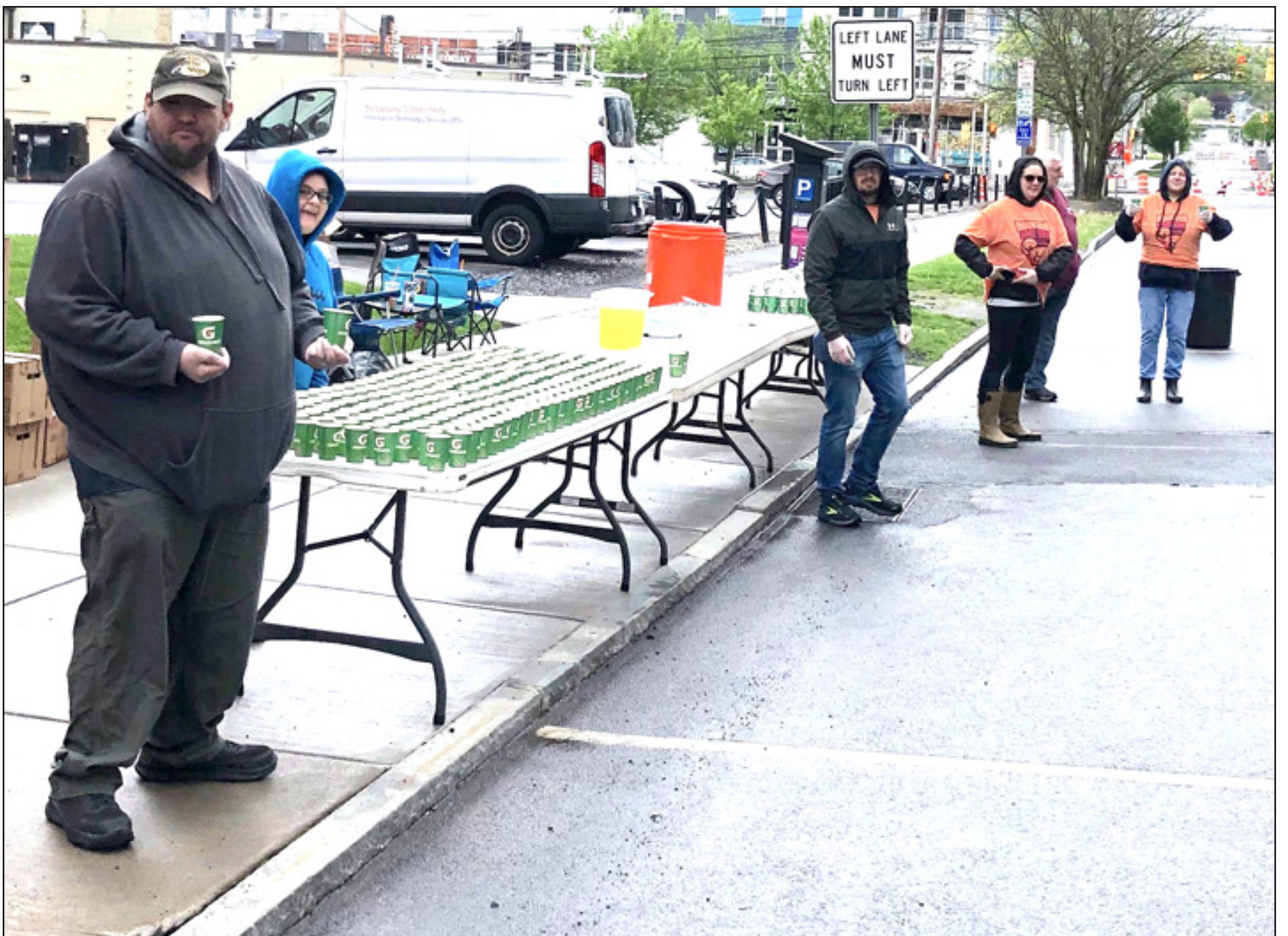
Members of Ft. Brewerton No. 256 and friends had a hydration station during the Mountain Goat Race in Syracuse. You can see a runner way down the road.