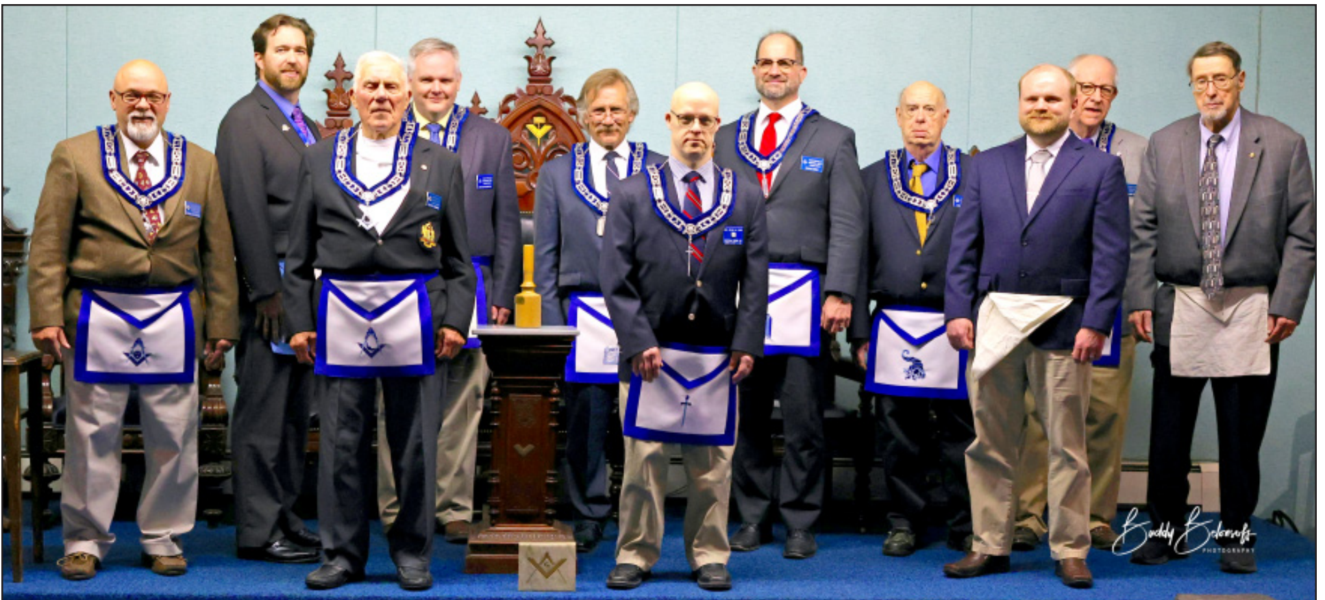
Here is the lineup at Fayetteville Central City Lodge No. 305 on Move-Up Night, 2024.