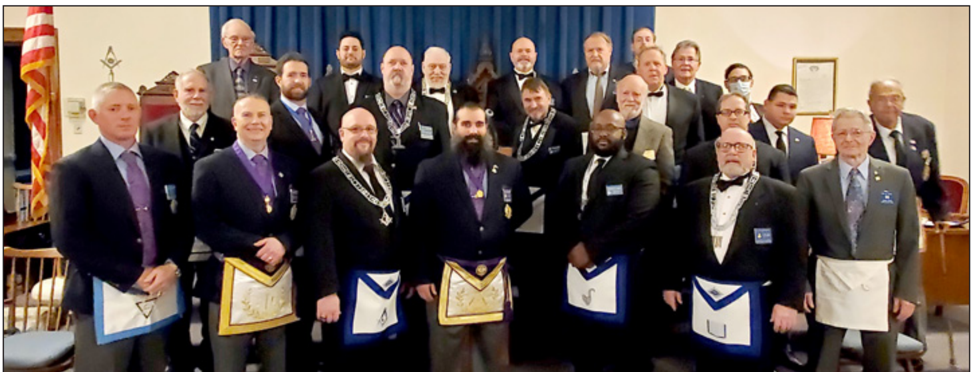
Large contingent enjoys the Liverpool Syracuse Official Visit.