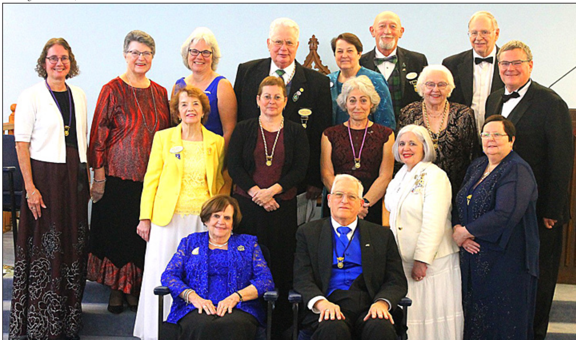
Centerville 185 Installation