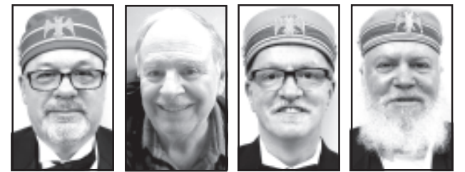
Central City Consistory Egnaczyk

This event is open to all but seating is limited to 65 this year, so make your reservations now. We will be downstairs behind the bar rather than upstairs. Make