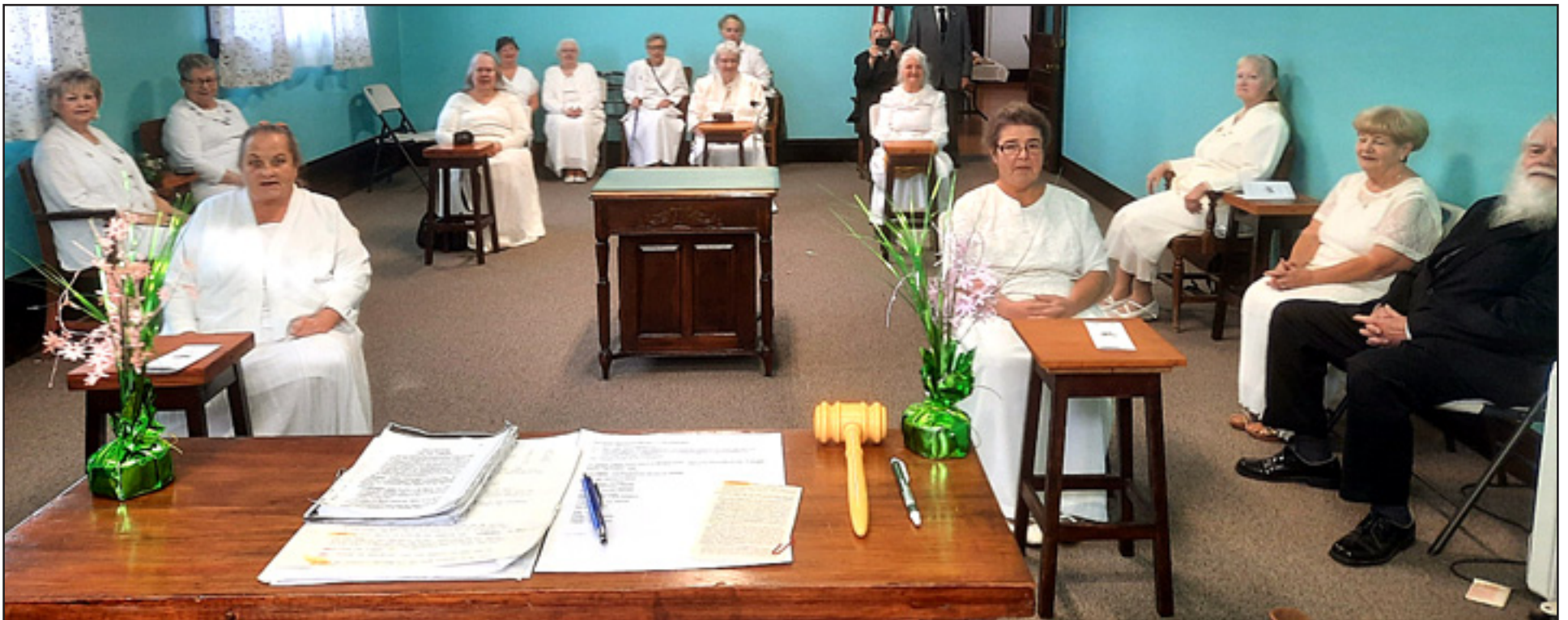
Phoenix Elizabeth No. 105 enjoys new, first floor room at Phoenix Masonic Temple.