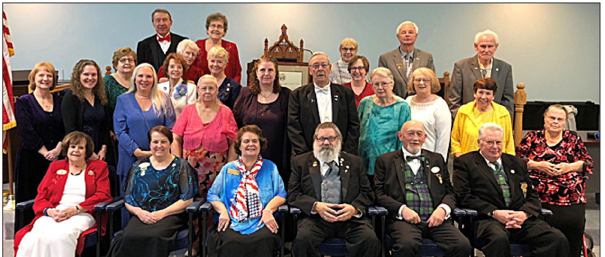
Onondaga Star Installation