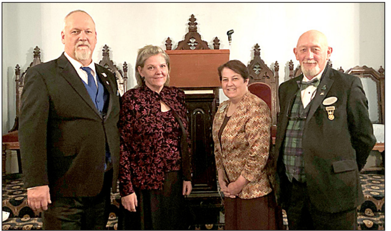
Morning Star Installation