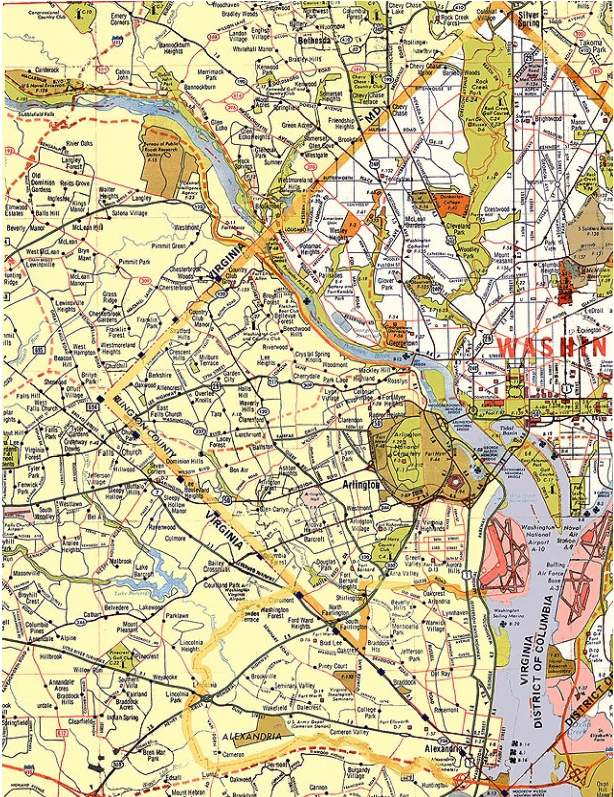
Map of Arlington, Virginia, circa 1964, before the Capital Beltway and Route 66 were constructed.