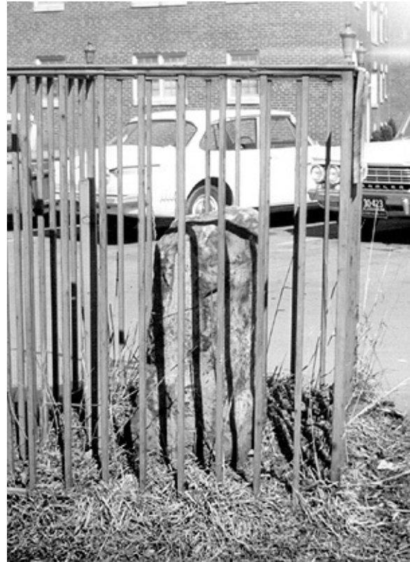
Number 8 stone in Arlington

The Number 8 stone on the southwest leg is located on McKinley Road near Wilson Boulevard (in the Willston Apartments area), about 100 feet from the water tower, and 200 feet from Wilson Boulevard. It may be approached from Wilson Boulevard by turning on to McKinley Road. It is across Wilson Boulevard from the Woodruff Estate. No markings are visible on the stone. It was on the Greer Farm. The plaque reads: "Original Federal Boundary Stone District of Columbia Erected 1791-1792 Protected by Dr. Elisha Dick Chapter Daughters of the American Revolution 1950". It was originally protected by the Dolly Madison Chapter, D.A.R.