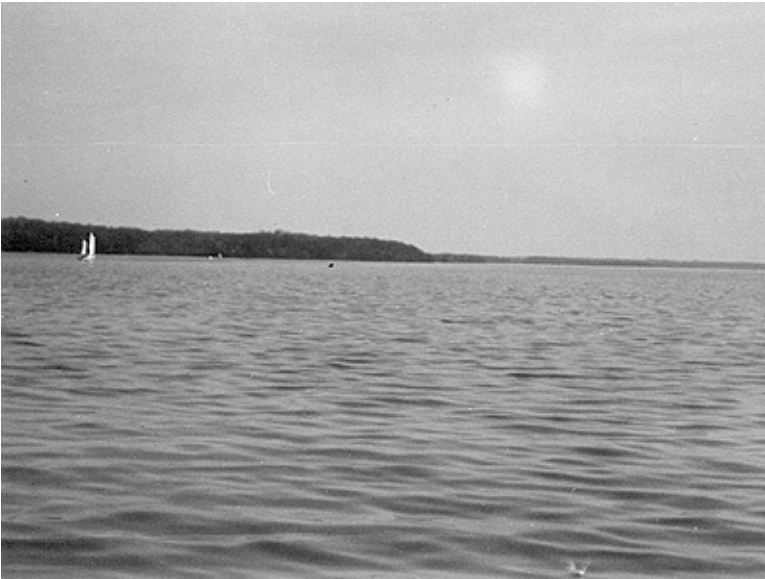
View looking SSE from the Zero Stone down the Potomac River