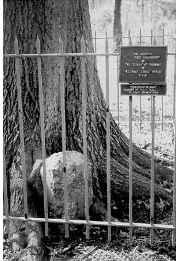
Northwestern Cornerstone in Virginia

The tree was cut to about 4 feet height in 1968.