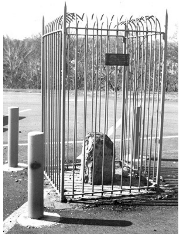
Number 3 stone in Alexandria, Virginia