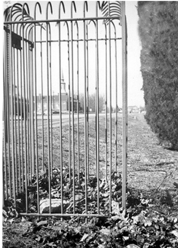
Number 4 stone in Arlington, Virginia

The Number 4 stone on the southwest leg is located on the northeast shoulder of King Street (Virginia Route 7 - the Leesburg Pike), approximately 10 feet north of South Wakefield Street and 3/10 of a mile south of Shirley Highway. This was originally buried under Route 7 but was subsequently dug up and placed in its present position. Only two small pieces of the original stone remain. It is now placed 13.30 feet north of its original position. This is the first stone located in what is now Arlington County. Formerly it was known as the Courtland Smith farm. The plaque reads: “The Original Boundary Stone District of Columbia. Protected by Continental Chapter, Daughters of American Revolution”.