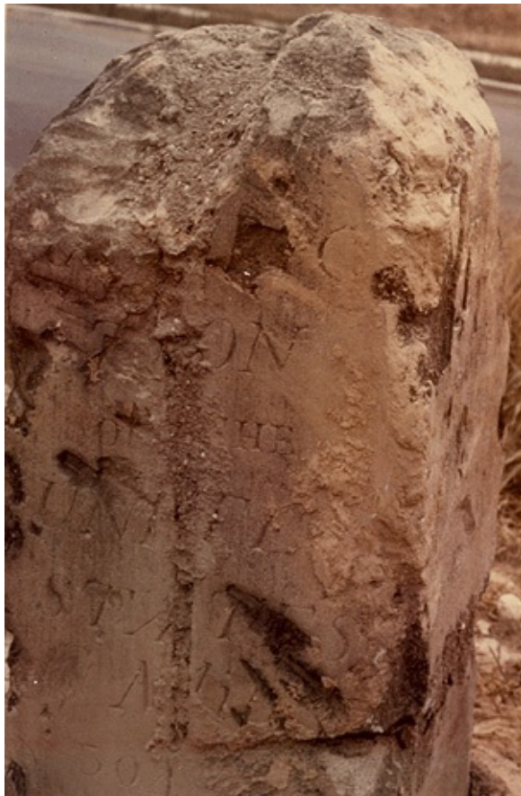
Number 6 stone in Arlington, Virginia