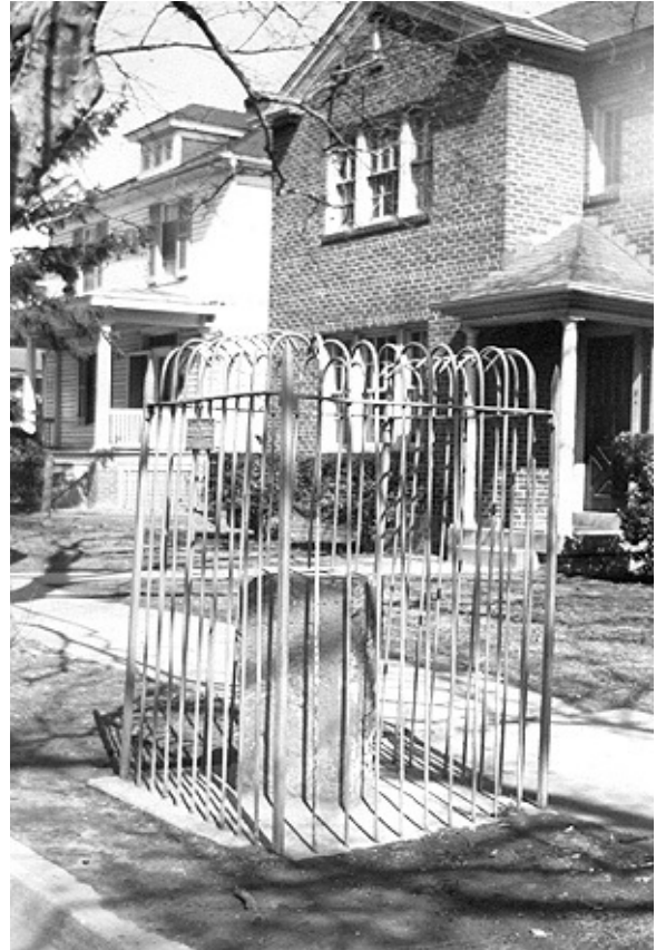
Number 2 stone in Alexandria, Virginia