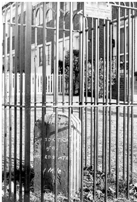
Number 1 stone in Alexandria, Virginia

When transplanted, the stone was turned 90° to the west so that the “Jurisdiction” side is now improperly facing northwest, rather than northeast. The stone is marked as follows: On the northwest side - “Jurisdiction off the United States 1 Mile”; on the northeast side in large figures is the date - “1791”; on the southeast side the word “Virginia”; and on the southwest side “Var 0° 30” West”, indicating the magnetic variation from true north at this site,