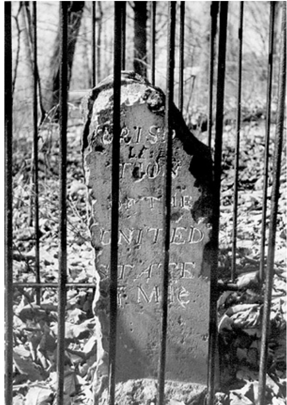
Number 1 stone in Arlington, northwest leg

The tree was cut to about 4 feet height in 1968.