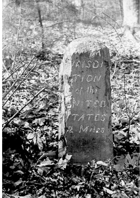
Number 2 stone in N.W. Arlington

On this stone the following is legible: “Jurisdiction of the United States 2 Miles”. No other marks are visible except “pot shots” taken by gunners. The stone is under the protective custody of the Old Dominion Chapter, D.A.R., Richmond, Virginia.