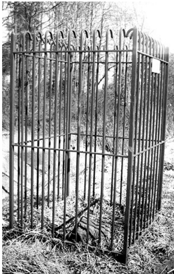
Number 5 stone in Arlington, Virginia

The Number 5 stone on the southwest leg is located on South Walter Reed Drive, about 500 feet off of King Street. (Although King Street now ends in Alexandria and this section is now Route 7). It is located on the high bank of a tributary to Four Mile Run, across the street from the 2700 block of Walter Reed Drive. Only a small portion of the stone remains above the ground, and there are no visible markings. It is 44.9 feet south of its original position. The plaque reads: "The Original Federal Boundary Stone 1921-1922 District of Columbia , 1791-1792 Placed, Protected by Key Stone Chapter, D.A.R. 1919". It is on the former James Payne Farm.