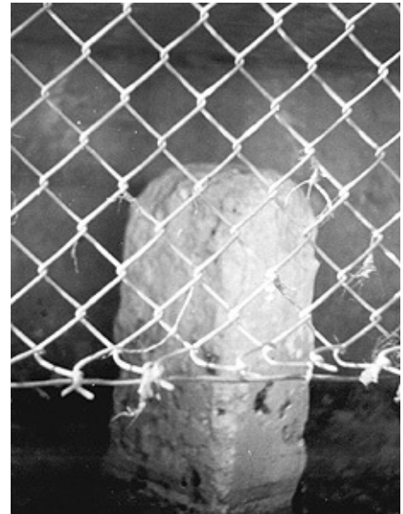
Closeup of Zero Stone showing deterioration

The 10 mile square District of Columbia was laid out at an angle from zero stone of 300^{\circ} as its western border and 45^{\circ} as its southern border. 16th Street runs due north.