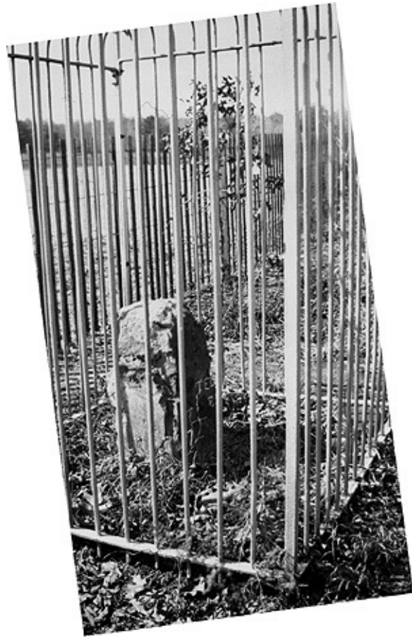
Number 7 stone in Arlington, Virginia