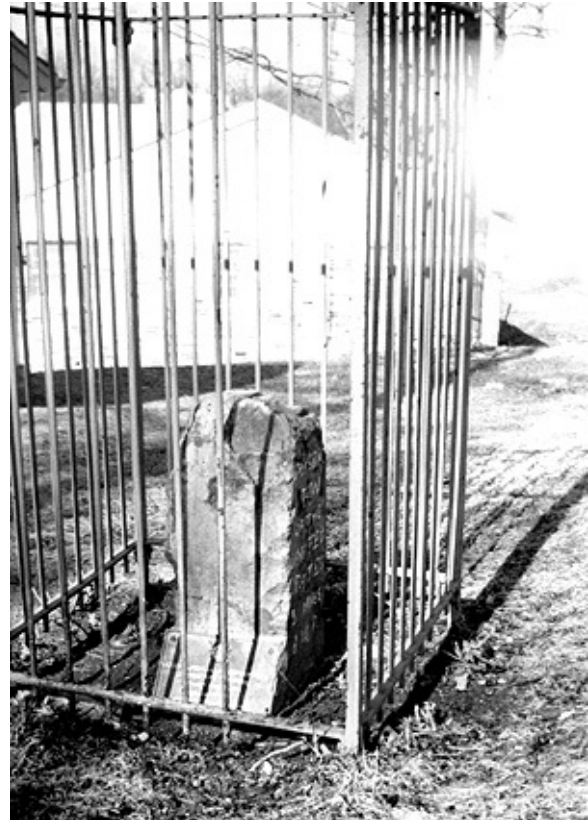
Number 3 stone in N.W. Arlington

Originally this stone was protected by the Sarah St. Clair Chapter (D.C.): transferred to the "Descendants of '76" chapter (D.C.) October 16, 1933, and rededicated by the Arlington House Chapter, Virginia, November 1, 1957 (not, however, without protest from the Descendants of '76 Chapter). Two rods on the southwest side of the fence have been broken off and removed.