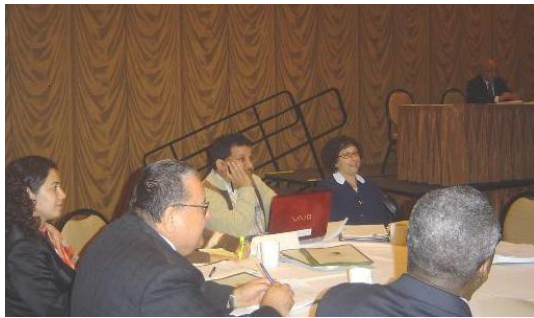
Thank you to all of our colleagues who traveled from near and far to join us in Houston, Texas!