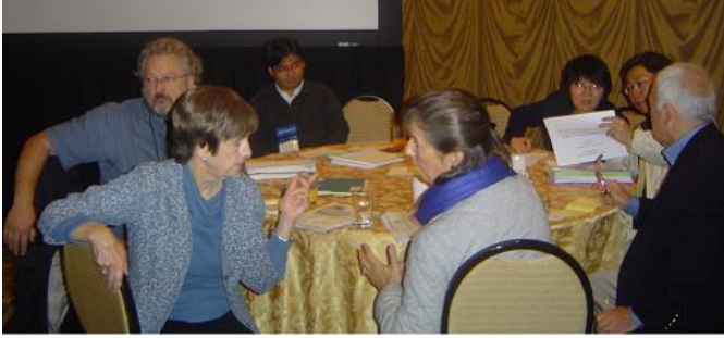
Colleagues from around the world share their work, ideas, and plans to develop more globally-minded citizens.