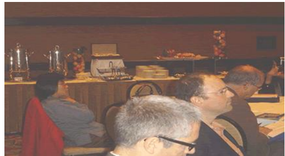
We collected interesting information from all speakers - from round tables to key note addresses.