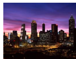
Atlanta skyline at night.