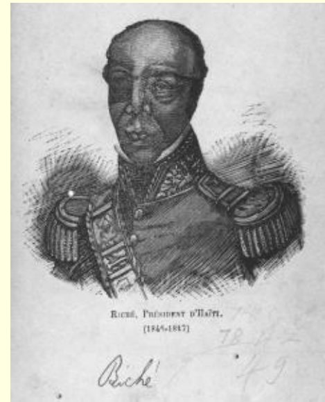
RICHÉ, PRÉSIDENT D'HAÏTI, (1844-1847)