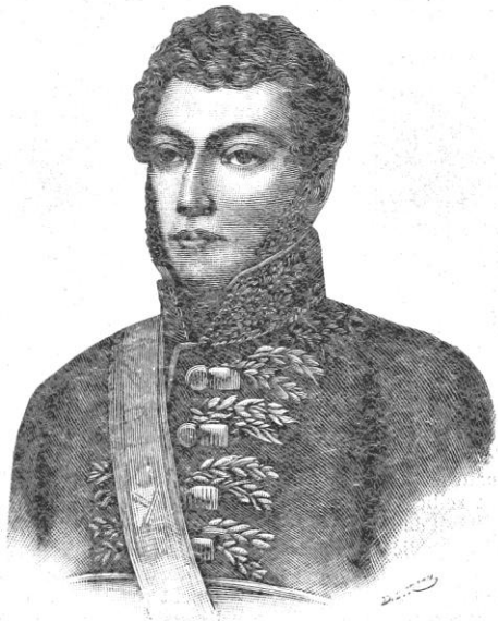
PÉTION, PRÉSIDENT D'HAÏTI (1807-1818)